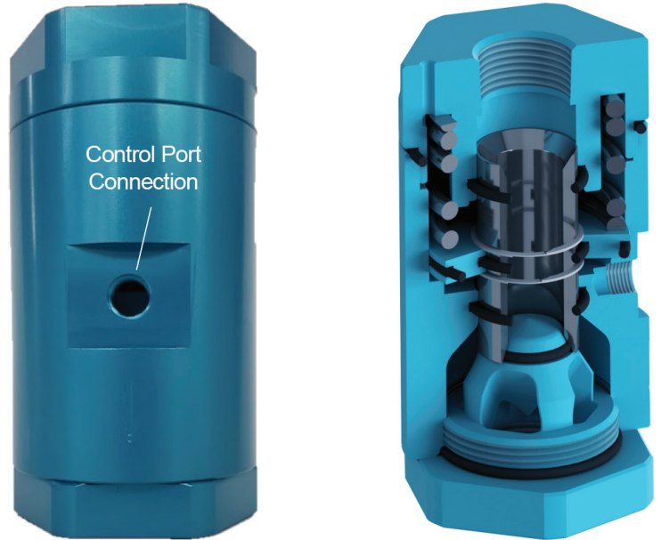
SENTINEL Normally Closed Shutoff Valve